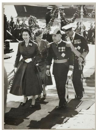
Figure 1. HM The Queen and Prince Philip arrive in Portugal. [State visit to Portugal, 1957] Feb 1957. Royal Collection Trust :IN 2003580

To begin, Britain and Portugal have been engaged in what could be considered one of the oldest active alliance between nation states dating back by treaty to 1373, the Treaty of Windsor, and this ‘continuous’ political friendship was reconfirmed in 1353, 1372, 1373, 1386, 1643, 1654, 1660, 1661, 1703 and 1815. 13 The Anglo-Portuguese alliance ( Aliança Inglesa ) has not always been followed explicitly throughout history and both sides have often opted to utilise or ignore agreements where necessary; witness, for example, the tensions between João IV and Cromwell’s party at a time Portugal sorely needed English military assistance in fighting the Guerras da Restauração . 14 Diplomatic relations with Britain during this time were good, cemented by an ‘international goodwill’ state visit from the Queen in February 1957 (one of many post-Suez fence-mending royal visits of that year) in which she inspected troops, visited the model Restelo housing project, met President Craveiro Lopes (himself a recipient of the Order of the Bath and Royal Victorian Chain) and Mayor Barreto of Lisbon. Footage from the British Pathé Press and Movietone News shows crowds following her every move, and a public holiday was declared in her honour.