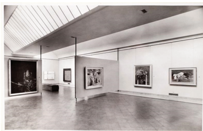
Figure 10. The British Art of the Twentieth Century exhibition: paintings by Francis Bacon, Roger Hilton (in the background) and Graham Sutherland. Oporto, Museu Nacional de Soares dos Reis, 1962.