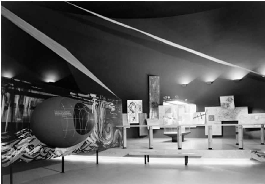
Figure 5. The view from inside the Exposição Henriquina , Belém, 1960. Catálogo da Exposição Henriquina (Porto: Biblioteca Pública Municipal, 1960)

was an interesting one. Temporary exhibitions had often been used by the Portuguese state to commemorate various aspects of Portuguese culture and heritage throughout its history; theorists have been relatively slow to recognise the museum as a vehicle of the state and ‘disciplinary society’. 51 Eleven temporary exhibitions dedicated to similar themes took place between 1940 and 1960. This includes the world exhibition of 1940 in Belém, which coincided with the tercentenary of the Portuguese Restauração , the 1947 exhibition commemorating the conquest of Lisbon, the 1953 exhibition commemorating twenty five years of Salazar in office, the 1957 exhibitions promoting industry, the sixth centenary of the birth of Nuno Álvares Pereira, and finally the 1960 exhibition on Prince Henry at the Museu de Arte Popular. 52