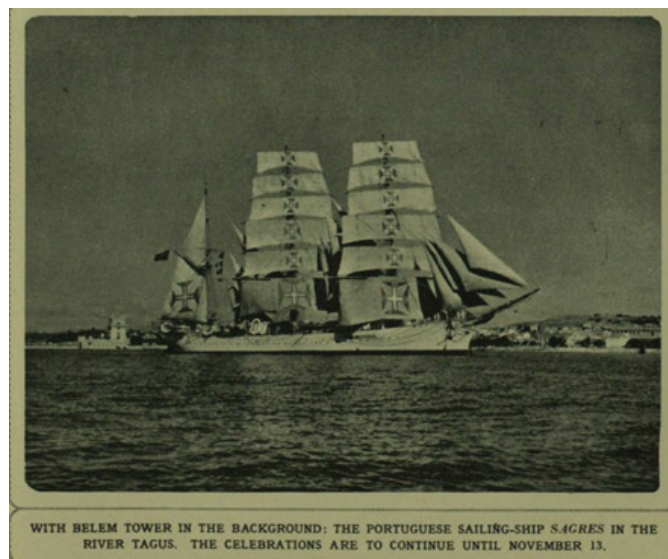
Figure 3. The Portuguese sailing ship Sagres leading the naval units to Belém. 'A Window on the World', The Illustrated London News , (Aug. 20, 1960) p.16.