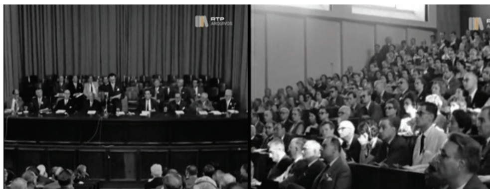
Figures 7 and 8. RTP Footage of the Congresso Internacional de História dos Descobrimentos / RTP Archives, (2018), url: < https://arquivos.rtp.pt/conteudos/encerramento-do-congresso-internacional-de-historia-dos-descobrimentos/ >; Other photos in Mário Cardoso, 'Congressos. Congresso Luso-Espanhol para o Progresso das Ciências, in Revista de Guimarães 70 (3-4) Jul.-Dez. (1960), p. 557.

members of his government, and a display of folk culture. It also included visits to the Exposição Henriquina in Belém, the Jerónimos monastery and that at Batalha, where Dom Henrique and his family are interred, the local towns of Alcobça and Nazaré, and the gardens of Monserrate palace. There was a strong focus on not just presenting the high points of Portuguese culture to the guests, but perhaps more importantly, creating a public display of this presentation as footage in the RTP archives testifies to. The celebrations were designed both to remind Portuguese citizens at home and abroad of their common bonds, but also to divert the populace's attention from unresolved national problems, including mass poverty, an undemocratic government and an unfree press. 75