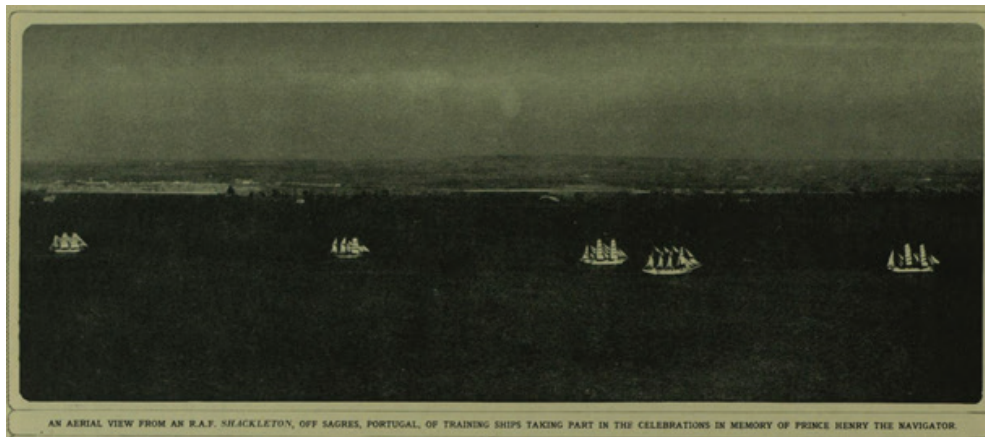
Figure 2. Aerial view of the naval review off Sagres from an R.A.F. Shackleton aircraft. 'A Window on the World', The Illustrated London News , (Aug. 20, 1960) p.16. The picture also appeared in "In Memory of a Medieval Venturer." Times , 9 Aug. 1960, p. 1. The Times Digital Archive .

They soon abandoned this suggestion though, once they learnt that there was no intention to invite diplomatic missions from the United Kingdom. 43