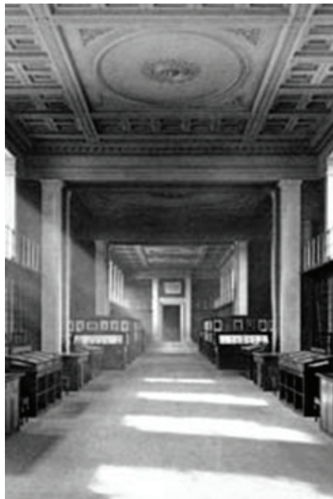
Figure 9. The King’s Library, British Museum, site of the 1960 exhibition ‘Prince Henry the Navigator and Portuguese Maritime Enterprise’. Frederick York, ‘The King’s Library’, a photograph, 1875. Care of Trustees of the British Museum.

five exhibitions were commemorations in 1960. 86 Principle Keeper of the Department of Printed Book, Robert Wilson, was unenthralled about these centenary celebrations. Writing on another proposal, to commemorate Count István Széchenyi of Hungary, he remarked: “only a few cases would be needed... the disadvantage is that it would be one more of these not very impressive centenary exhibitions of which, in my view, we have already had a surfeit. The advantage is that it would serve to show something of our riches in foreign, not to say outlandish, material.” 87