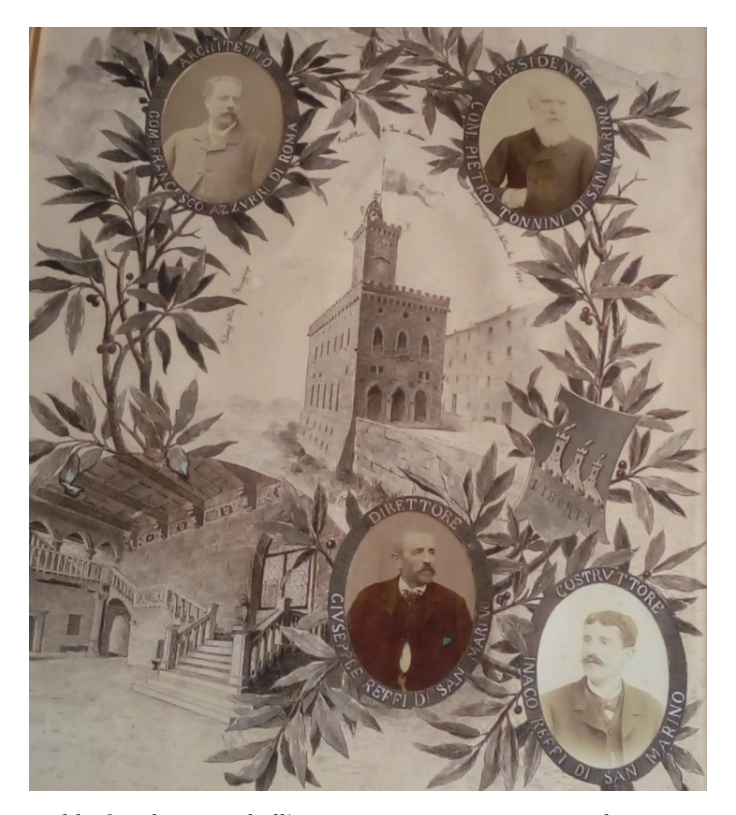
6.\ \, Those responsible for the town hall's construction, as represented on a contemporaneous stamp (detail)

significantly smaller scale, the Sammarinese town hall evokes the Tuscan republic's Palazzo della Signoria, attributed to Arnolfo di Cambio. Dating to the early fourteenth century (though the charming mullioned windows in its facade are Neogothic), the Palazzo della Signoria had not many years previously served as the first seat of the parliament of the Kingdom of Italy, from 1865 to 1871.<sup>29</sup>