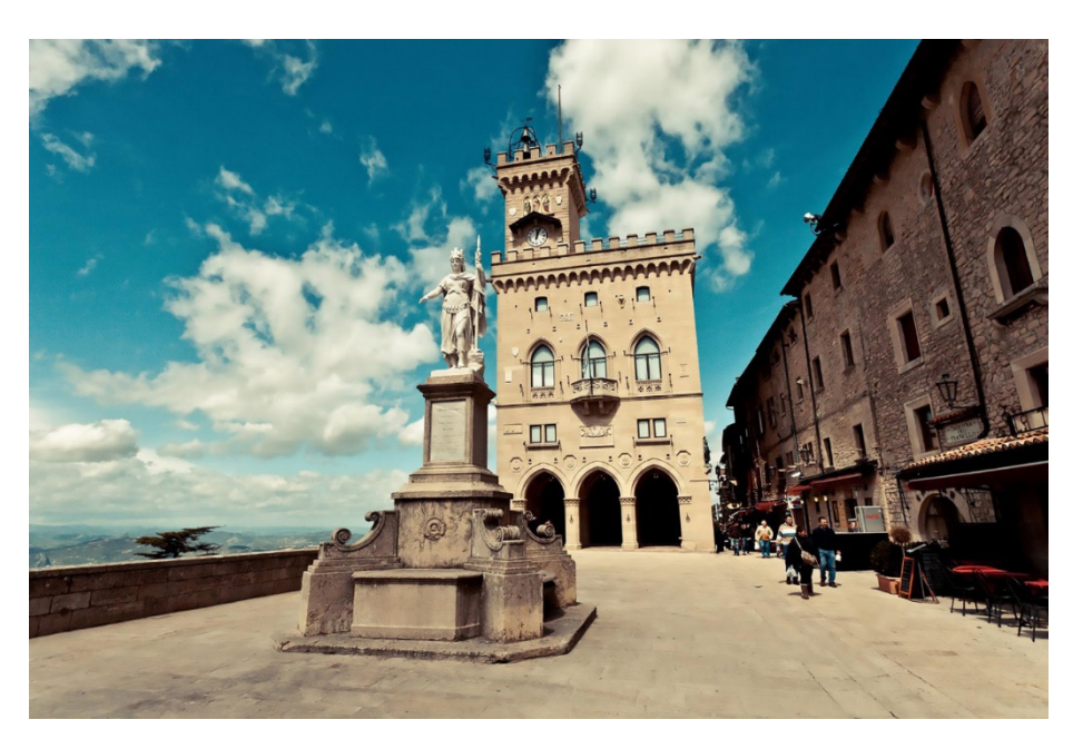
7. \ {\rm San \ Marino's \ town \ hall \ today \ (photo \ found \ online, \ with \ Creative \ Commons \ license)}