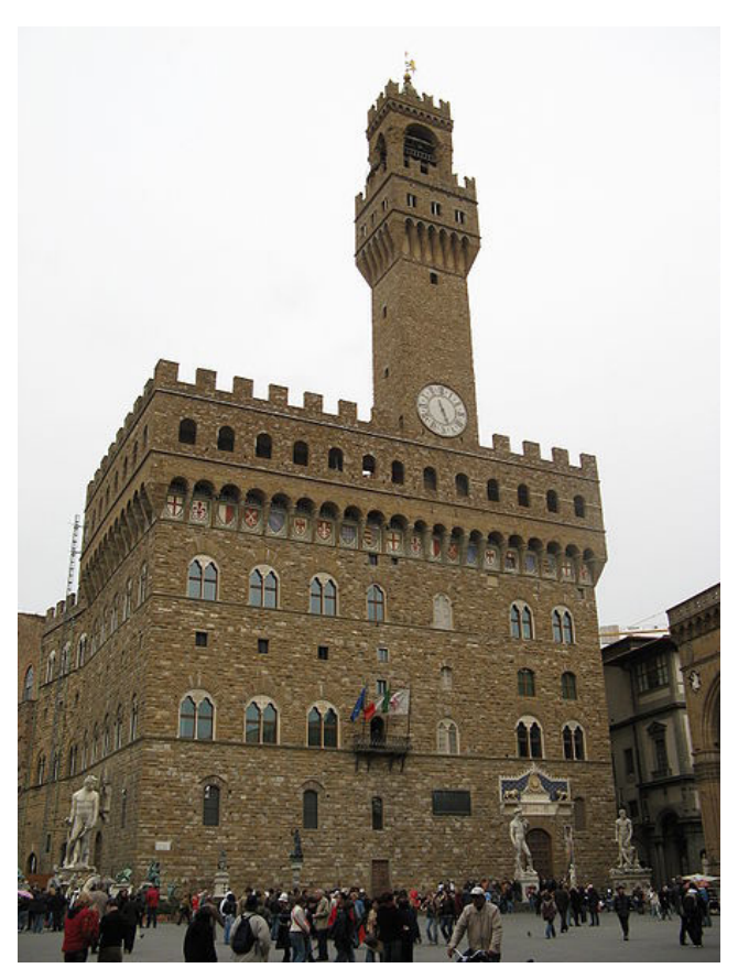
8.\ Florence,\ Palazzo\ della\ Signoria\ (photo\ found\ online,\ with\ Creative\ Commons\ license)