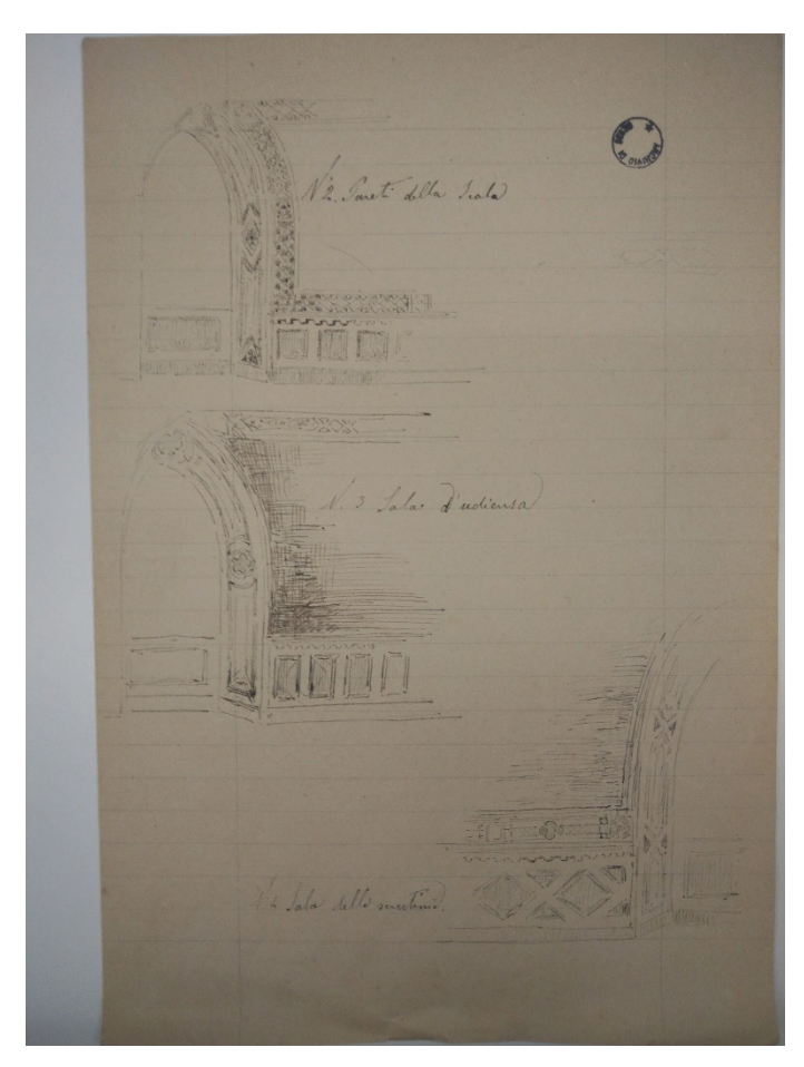
5. Francesco Azzurri, sketch for three windows, AS RSM, Fabbrica del palazzo pubblico, Disegni, piante, corrispondenza (F. Azzurri), b. 56.

This "undertaking of pure late romantic fantasy," through which the core institutions of the Republic of San Marino cloak themselves in medieval guise, must be read, even in the modesty of its dimensions, alongside other celebrated instances of Neogothic architecture constructed for analogous purposes: above all, London's Palace of Westminster, seat of the Houses of Parliament (1840–1865), the city halls of Munich (1867–1908) and Vienna (1872–1883), and the Hungarian Parliament Building in Budapest (1883–1902). More city-state than miniature nation, the immediate model for San Marino was that which was perceived as the medieval republic par excellence: Florence. Despite its