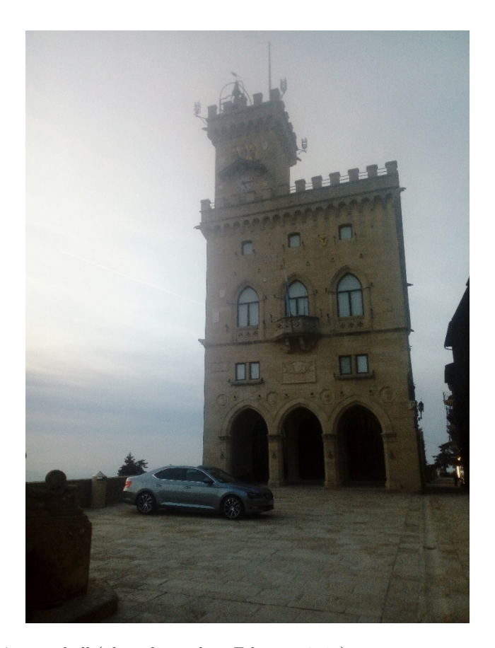
1. San Marino's town hall (photo by author, February 2019)

both represents and performs the site of encounter between history and imagination. The three fortresses stand on the ridges of the mountain, the streets are well paved, multiple circuits of crenellated and turreted walls encircle the city, the facades of the houses and buildings are constructed with perfect ashlar blocks of sandstone, the local stone, which appears yellowish, whitish, or grey, and is expertly and artisanally carved. Everything appears neat and new.