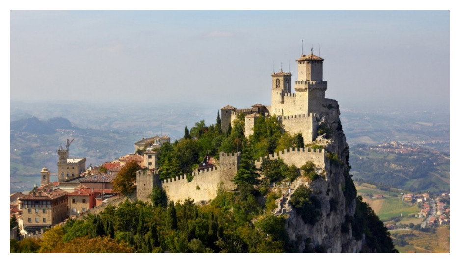
11. Rocca della "Guaita" of San Marino (photo found online, with Creative Commons license)

one "that was offered [...] to a nascent mass tourism and that came to form part of the [city's] traditional image."