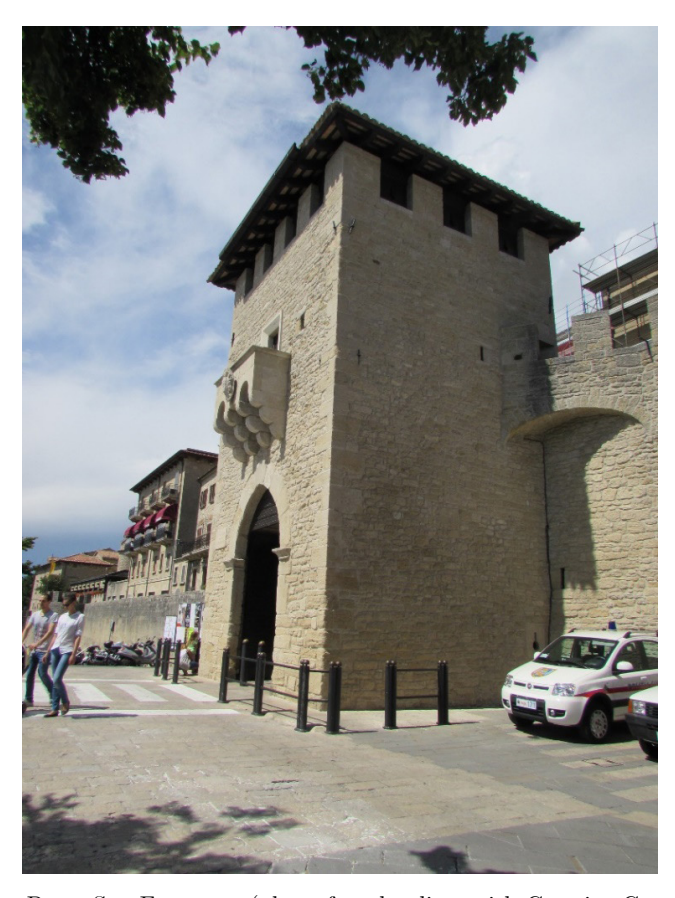
10. San Marino, Porta San Francesco

But what motives underpinned the launch and the completion of a project of such grand dimensions and notable consequences? Zani's ambitious project responded to numerous exigencies. First and foremost, it sought to remedy the objectively dismal physical conditions of San Marino's architectural patrimony. The walls were in disastrous condition and the entirety of the old city was in need of a general sprucing up to make it suitable for modern habitation. Zani's concept of a complete and detailed reconstruction of the city prevailed over a second, competing proposal, which would have consolidated San Marino's walls and fortresses but left them in a state of ruin, in homage to a Romantic aesthetic that was no longer widely shared.<sup>56</sup> Second, the