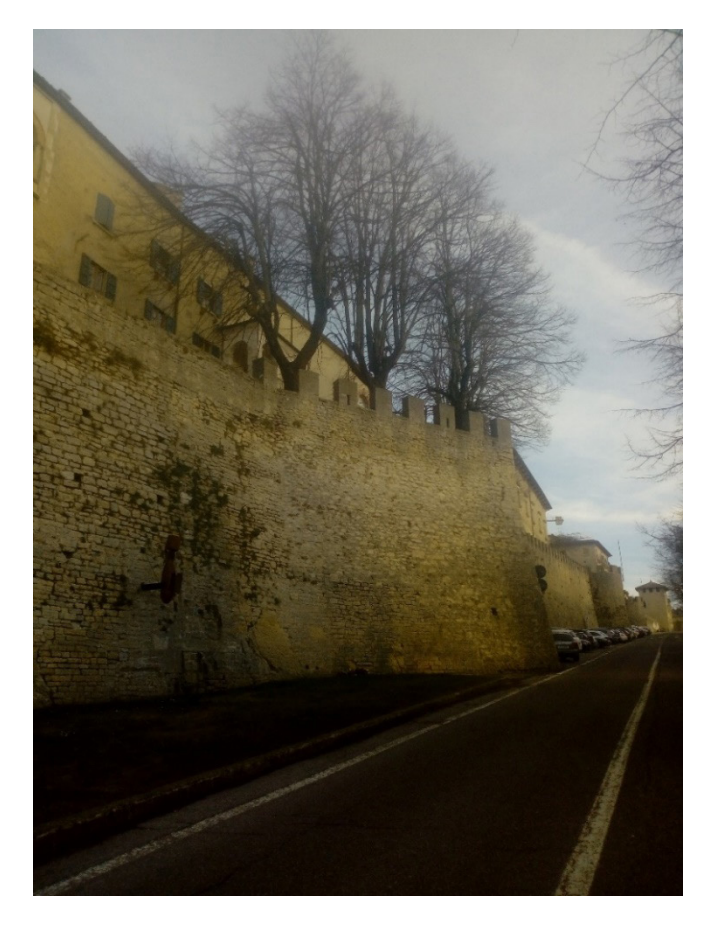
9. The walls of San Marino (photo by author, February 2019)

principle for Sammarinese identity, which would no longer by determined solely by the forbidding Monte Titano or individual buildings to be reconstructed along neo-medieval lines, but by the entire city inserted within its full and unique environmental context, an approach embraced fully by Zani. Ricci wrote the preface to Zani's Le fortificazioni del monte Titano (1933), an essay on historical reconstruction and a profile of the architectural project that preceded by only a few years the author's massive reconstruction of San Marino.<sup>45</sup>